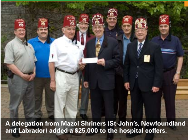
A delegation from Mazol Shriners (St-John's, Newfoundland and Labrador) added a $25,000 to the hospital coffers.